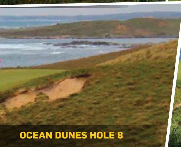
OCEAN DUNES HOLE 8