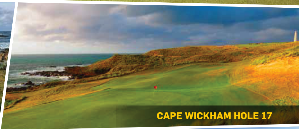
CAPE WICKHAM HOLE 17