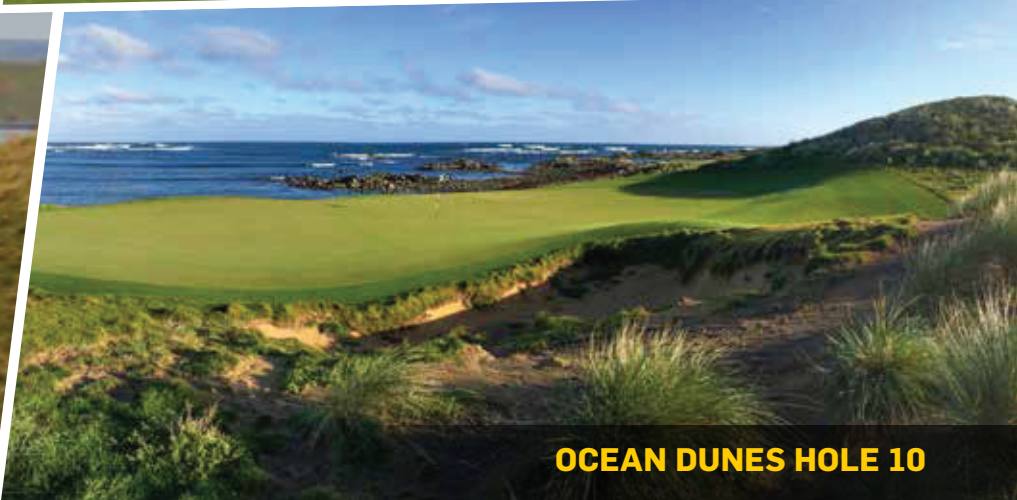
OCEAN DUNES HOLE 10