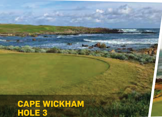
CAPE WICKHAM HOLE 3